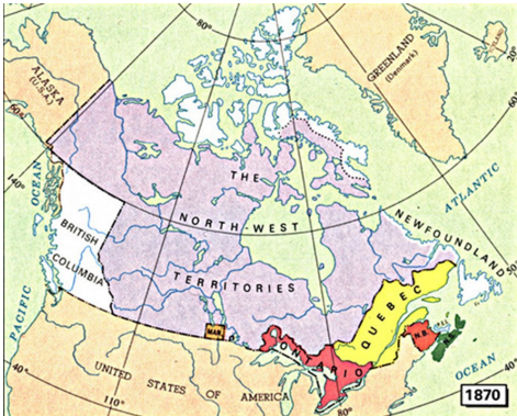
The North-West Territories (Rupert's Land and the North-Western Territory) are acquired by Canada from the Hudson's Bay Company. From part of them Manitoba is created as the fifth province.

2. What are the changes in the maps of Canada that you see below?