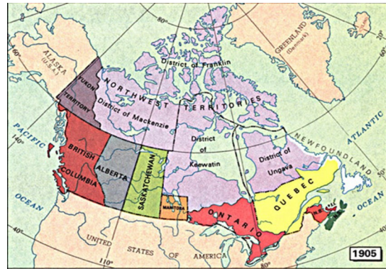
Alberta and Saskatchewan are created as provinces to make a total of nine provinces in the Dominion of Canada (1905). The District of Keewatin is transferred back to the Northwest Territories. Due to changes in adjoining areas the boundaries of the Northwest Territories are redefined (1906).